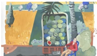
After Two Months In "Art"