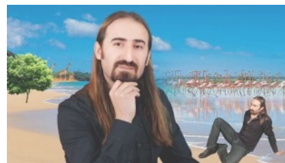
Ashes to Ashes, Funk to Funky In "Art"